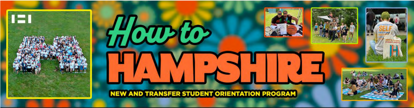
Issue #3 - July 5, 2022, Division of Student Affairs