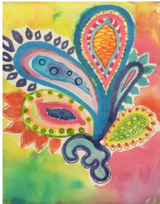
(art: Emma Pici-D'Ottavio)

My Division III study supports the notion that creating art is an effective means to facilitate recovery from depression. I measured the mood and self-esteem of participants before and after completing a reflective drawing exercise. As predicted, the exercise brought about significant effects and depressed participants displayed the most positive changes.