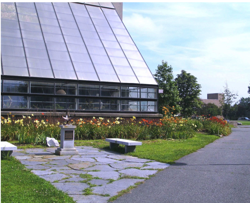
Daylilies and John Reid Memorial Sundial, Cole Science Center, Hampshire College