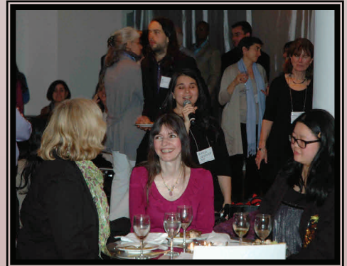
NYC Alumni Reel 2012.

June 8-10, 2012: Hampshire alums continue to make positive changes in the world in myriad ways. Come celebrate “Non satis scire” and share insights, resources, and perspectives at the Div IV forum on Social Change . On campus.