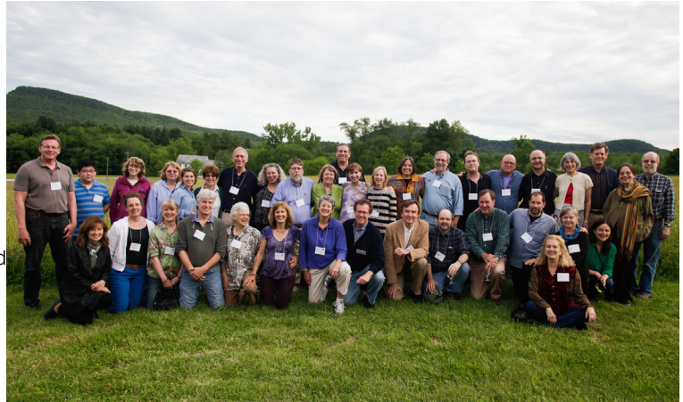
Members of the class of 1973 and friends at their 40th reunion in June.

OCTOBER 18–20, ON CAMPUS: Family and Friends Weekend includes lectures, readings, workshops, exhibitions, and other events that showcase the amazing work of students, faculty, and alums. Come enjoy the student experience and the ways in which alums have translated that experience into exciting careers.