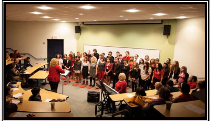
The Hampshire College Chorus performs during Family, Alumni, and Friends Weekend.